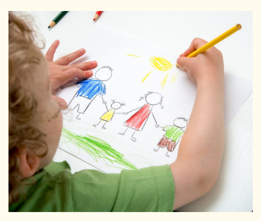
Draw with your kid!