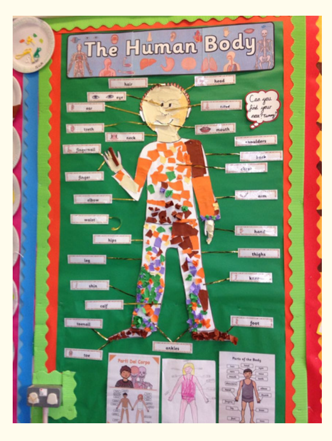
Use it as a learning poster.