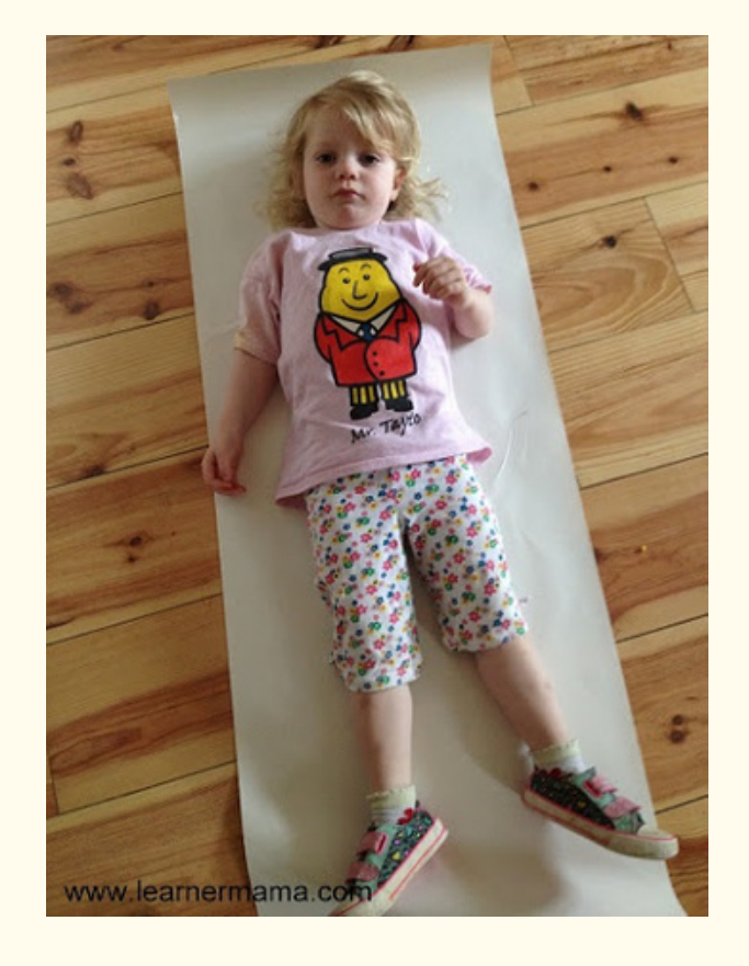
Outline the posture on the paper.